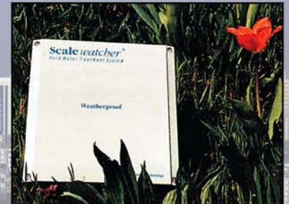
Scalewatcher Commercial weatherproof, special for outdoor installation